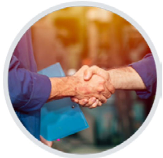
Engineering Consultancy Services