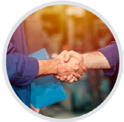
Engineering Consultancy Services