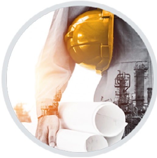
MEP & Project Management Services

At Mckeen, we always apply our engineering expertise and customize our consultancy services to surpass our clients' expectations in variety of products such as